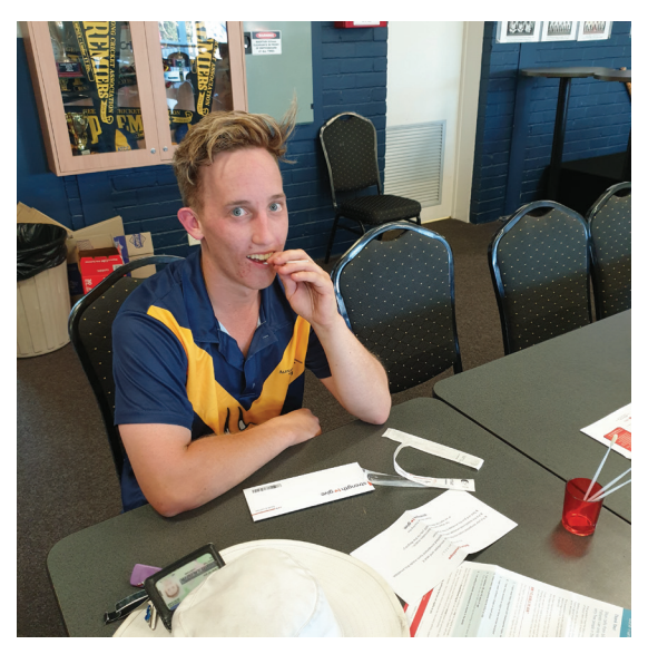
A young cricket player completing his cheek swab at his club.

Only a small number of people are called and asked to donate their stem cells. If you're matched with a patient in need, 90% of the time donating stem cells is like giving blood. It's simple and can save a life!