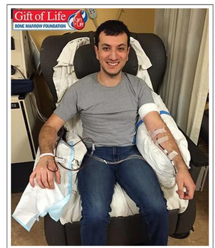
A donor in the middle of donating his stem cells.

The CURE to some blood cancers is in YOUR body! You just need to join The Registry to be searched and matched with a patient in need!